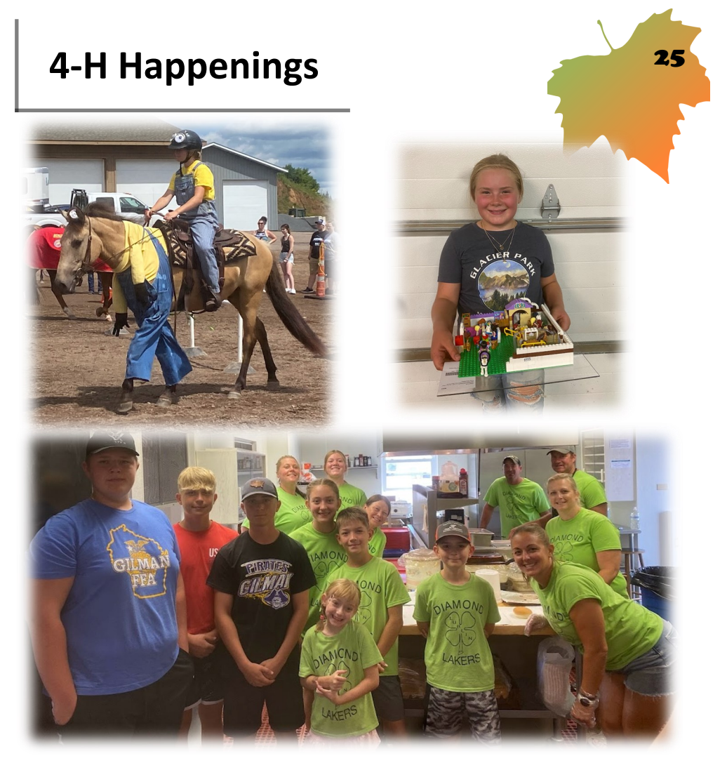
2023 4-H Summer Camp WI Northern Regional