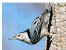
White Breasted Nuthatch